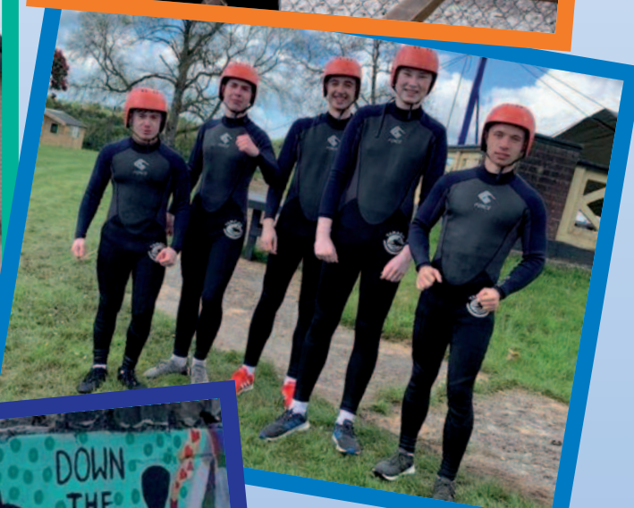
TY Students all ready for some Kayaking on one of many team building trips taken outside of school