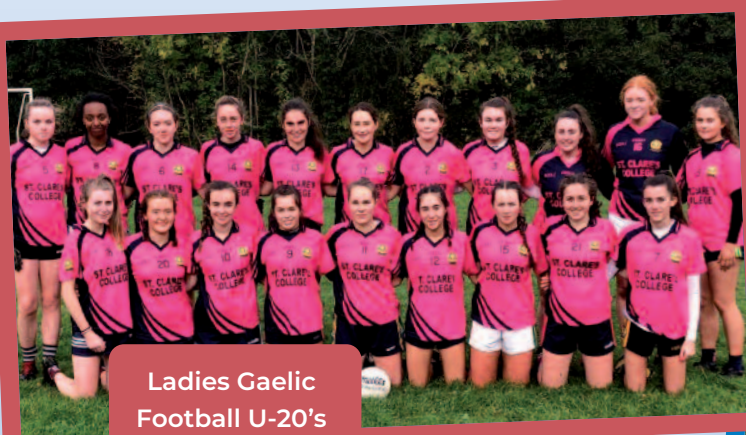
Ladies Gaelic Football U-20's