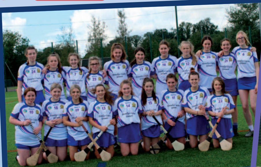
Under 16 Camogie Team at the first game of the season. Recent years St. Clare's College have been very successful at Ulster Colleges' Camogie