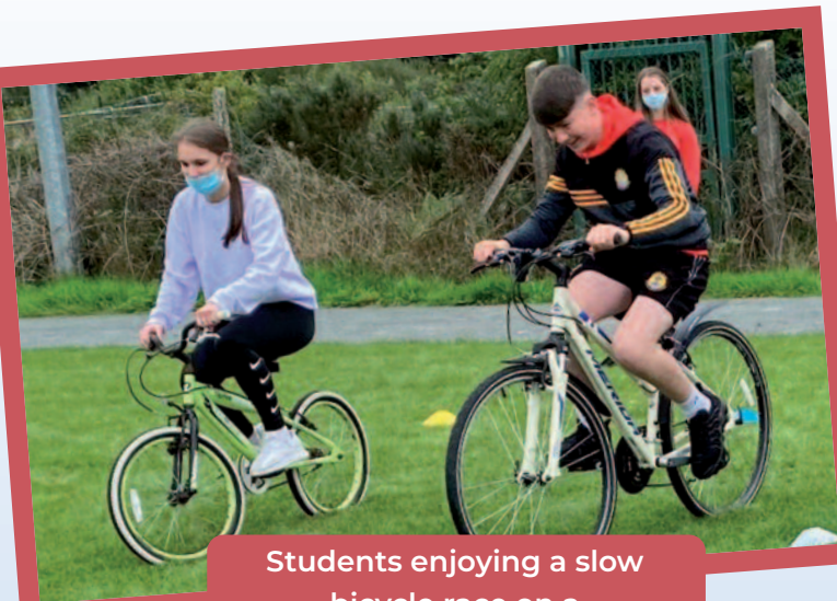
Students enjoying a slow bicycle race on a Wellbeing Day

HEALTH PROMOTING SCHOOLS: St. Clare's College is a Health Promoting school since June 2019. A health promoting school is a "school that constantly strengthens its capacity as a healthy setting for living, learning and working". We will continue to work on the three strands of physical activity, mental health and wellbeing.