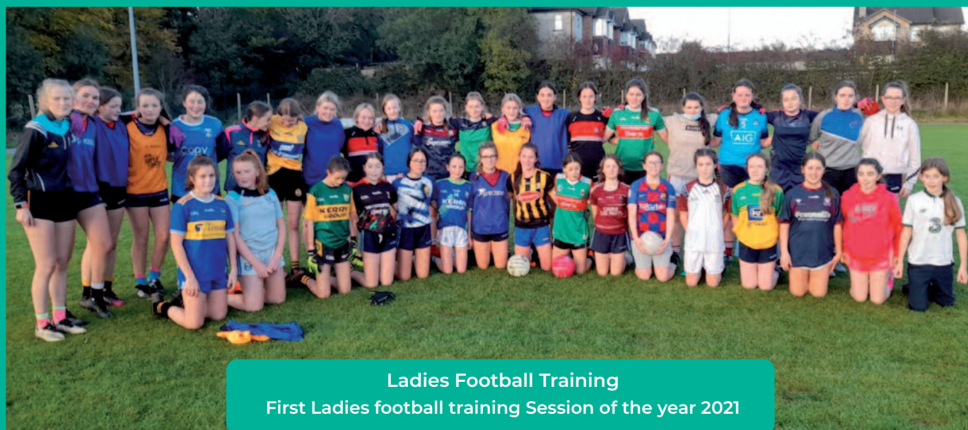
Ladies Football Training First Ladies football training Session of the year 2021