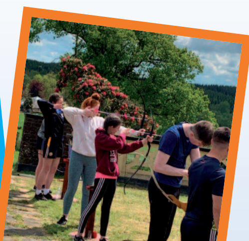
TY students practice their archery skills in Carlingford Adventure Centre on an overnight bonding trip