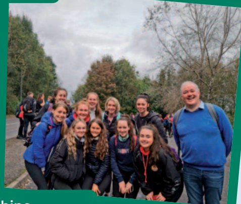
Students and Staff enjoying the sunshine on their annual retreat to Killykeen Forest Park