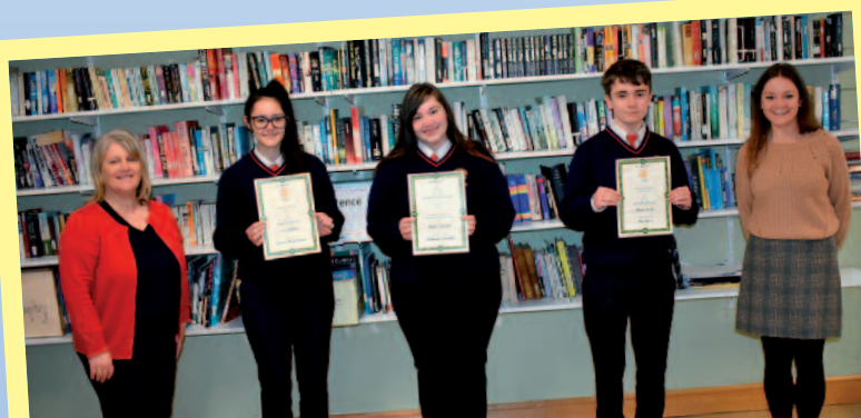
Students receiving their awards in the Allingham Arts Festival Writing Competition