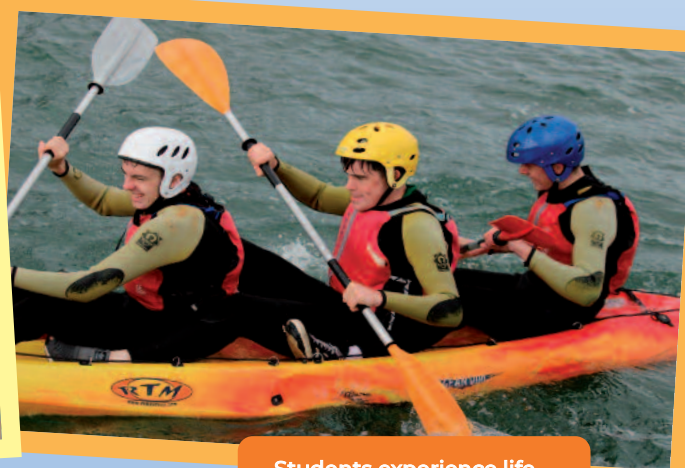
Students experience life outside the classroom with some Kayaking in Cavan Adventure Centre