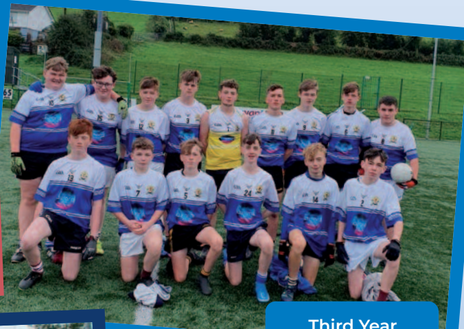
Third Year Boys Blitz