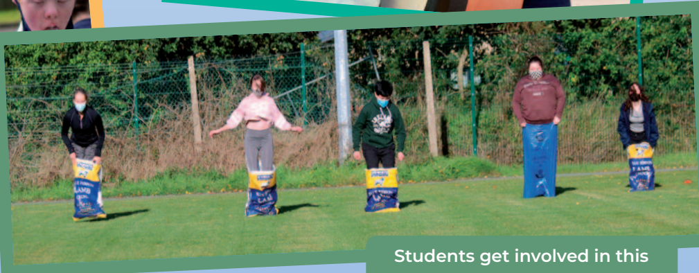
Students get involved in this year's sack race on sports day