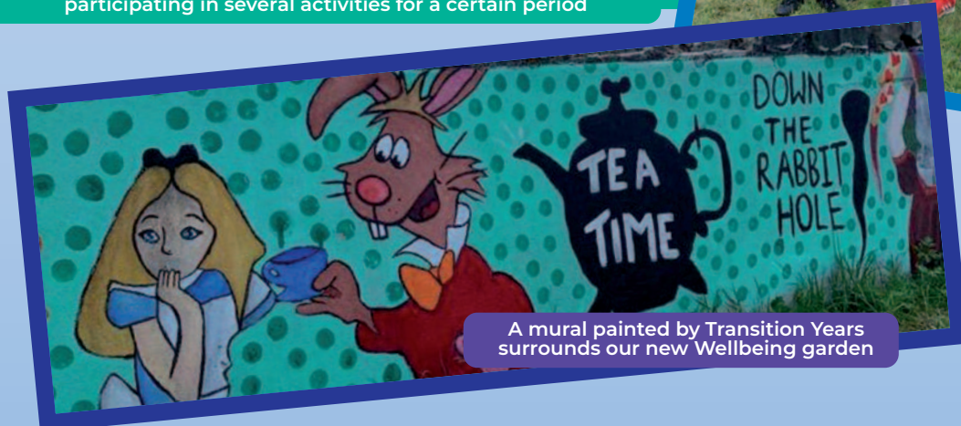
A mural painted by Transition Years surrounds our new Wellbeing garden