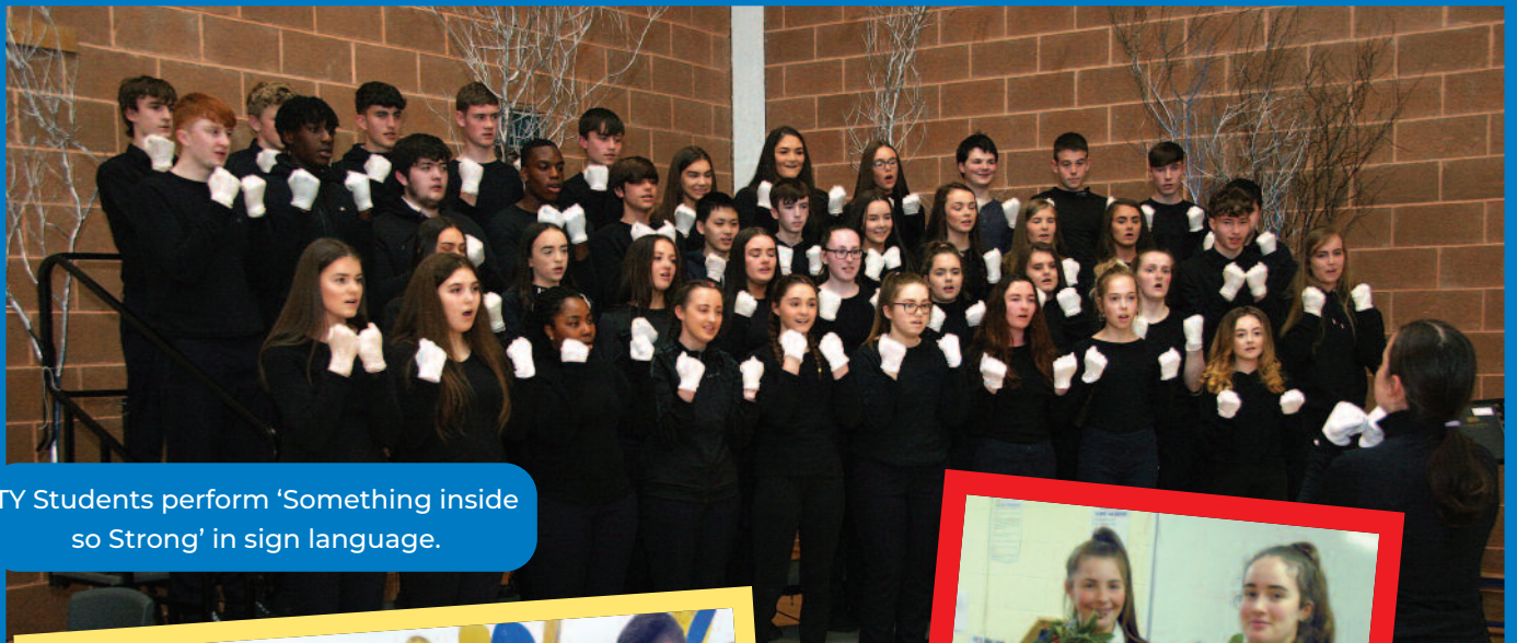
TY Students perform 'Something inside so Strong' in sign language.