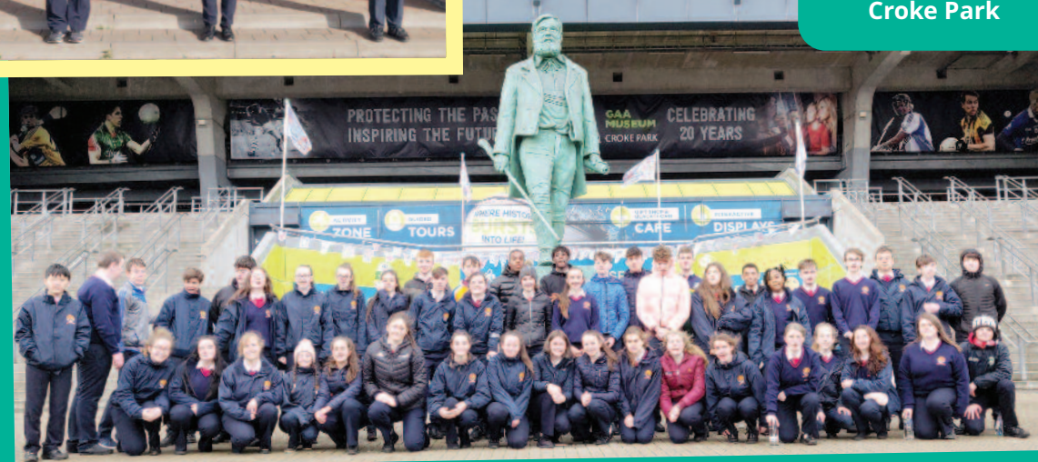
Transition Year enjoyed a trip to Croke Park