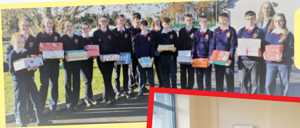
LCVP Students organised a Shoe Box appeal for Team Hope which delivers Shoe Boxes to children in Africa and Eastern Europe.