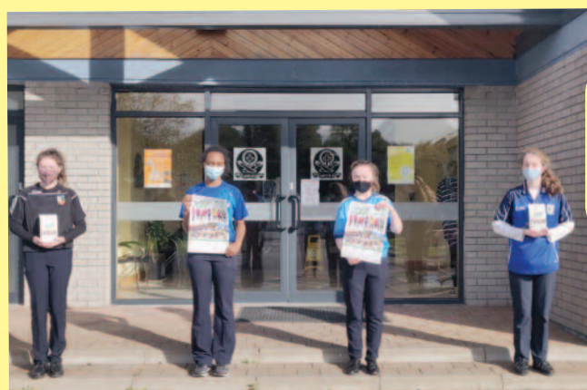
GOAL JERSEY DAY 2020 Students wear their favourite jersey to school to fundraise money for vulnerable communities in the developing world.