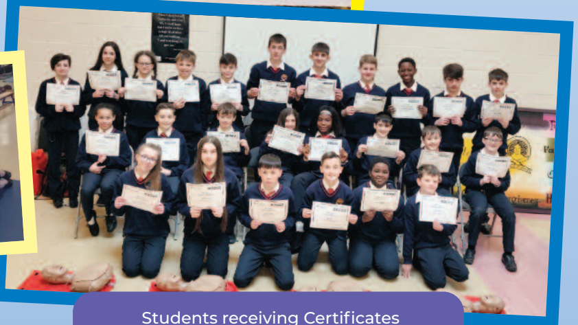
Students receiving Certificates in Irish Heart Foundation CPR 4 Schools.