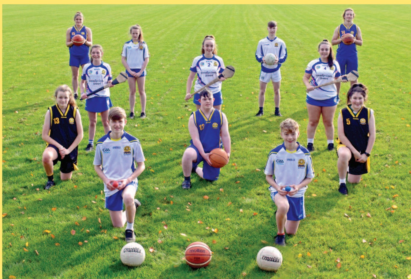
Photo shoot on newly developed sports' field and running track at St. Clare's College.

Students, representing the many sports' teams in St. Clare's College pose on our newly developed sports' field. The field with running track is a great additional amenity for students in St. Clare's College.