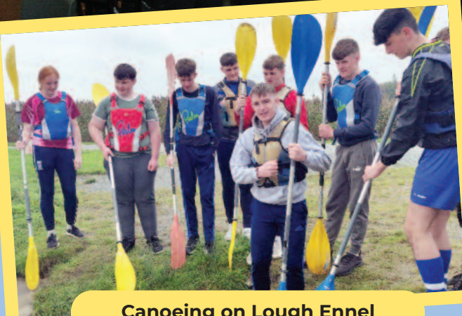
Canoeing on Lough Ennel